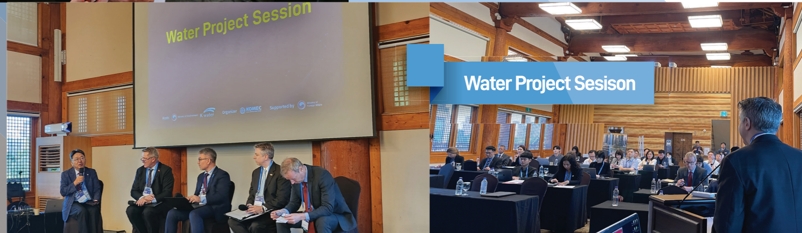
Water Project Session