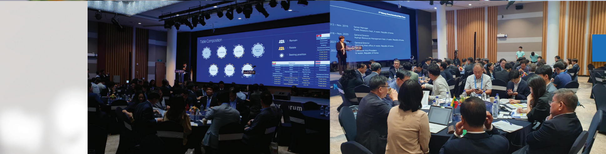
Round Table Session

Mekong-Korea International Water Forum(MKWF) is an annual international water forum organized by KOMECE gathering the Mekong countries and multinational development partners.